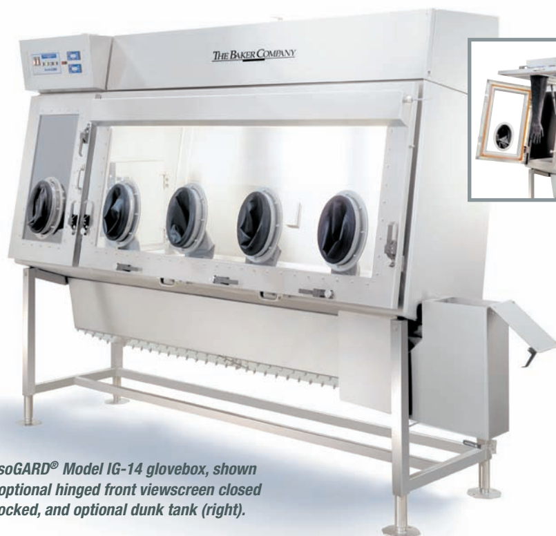
The IsoGARD® Model IG-14 glovebox, shown with optional hinged front viewscreen closed and locked, and optional dunk tank (right).