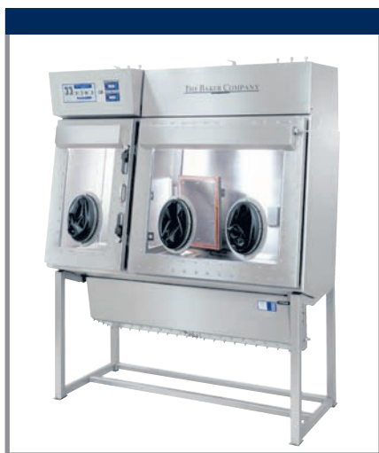
The IsoGARD® glovebox, Model IG-12.

Additionally, IsoGARD® ergonomic features make for a glovebox that is much more comfortable to work in than those of the past. These include oval gloveports mounted directly into the 10° tilted viewing window, exhaust plenums located away from a sitting operator's knees and external light canopies positioned above the user's head.