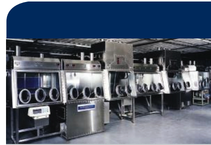
The Baker Company was commissioned by a customer to build a custom Class III containment line to handle research and work with a Biosafety Level 4 pathogen.