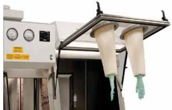
A viewscreen top hinge allows full opening for loading of instrumentation or equipment. The viewscreen is locked to prevent unauthorized opening.